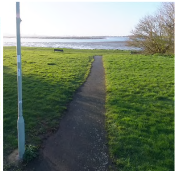
Fig. 6 – Just north of Point E, looking south