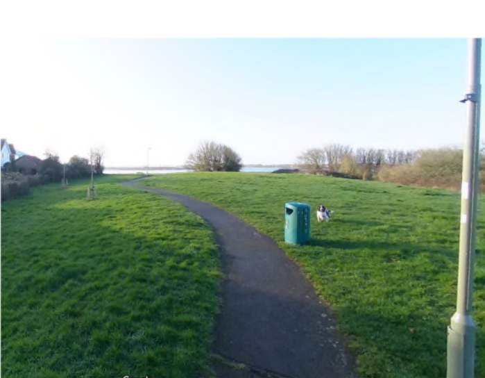
Fig. 5 – Just south of Point C, looking south