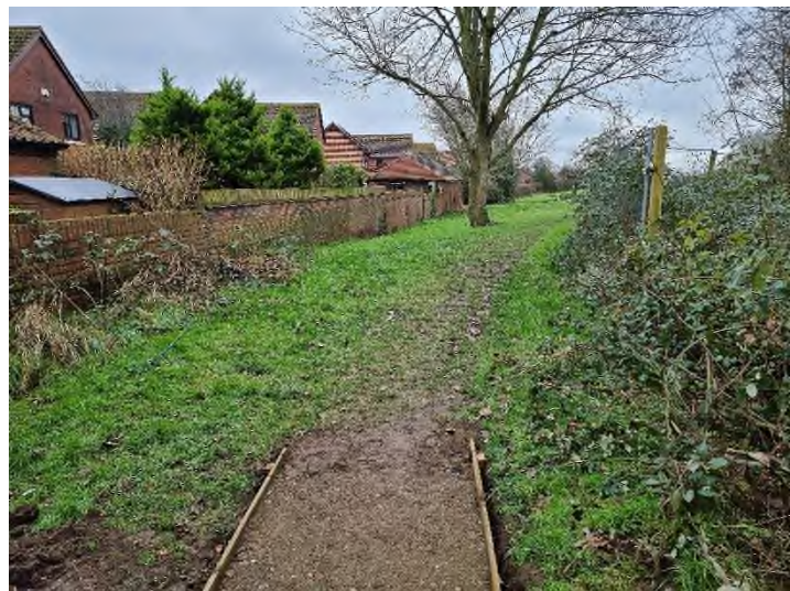
Fig 2. Between B-C, facing south

2.7 At Point C the path merges with a metalled, 1.8 metre-wide path that is currently maintained by FBC. The path commences at a junction with Audret Close (Point D) and runs between houses emerging into the public open space maintained by FBC. The path is lit, and a litter/dog waste bin is situated just south of Point C. Two benches are positioned either side of Point E, where the path meets the recently confirmed route of the King Charles III England Coast Path (see location map at Appendix 1). The images below show different sections of this route between D-E.