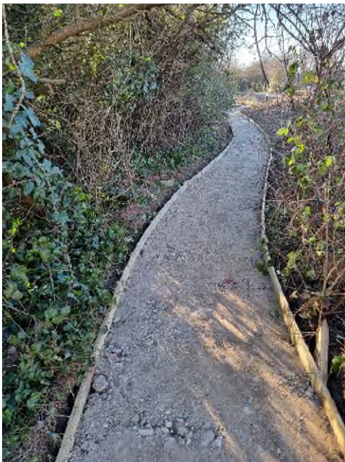
Fig 1. Between A-B, facing south

2.6 In recent months, Abri has constructed a hoggin path 1.2 metres in width over part of section A-B-C, in accordance with a planning condition relating to the development to the north. The final section of the route between B-C remains a grass path, but discussions between Abri and FBC are ongoing as to how to connect this route into the pre-existing metalled path at Point C. Photos of this section are included below.