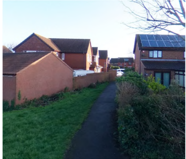
Fig. 4 – At Point C looking east to Audret Close