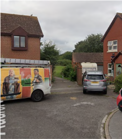
Fig. 3 – On Audret Close looking west to Point D